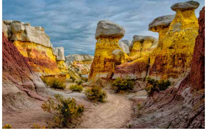
Paint Mines Hoodoos