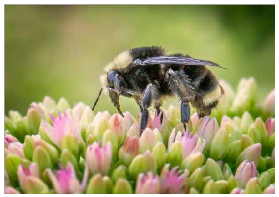
Bumble Bee Working

Sharp has served on the Photographic Society of America Print Collection Committee since its inception in 2011. The Committee was created to secure the preservation of and document the Society's collection while also making it more accessible and open for new images. Sharp has also served as a Portfolio Assessor for the PSA Portfolio Distinctions program since its inception.