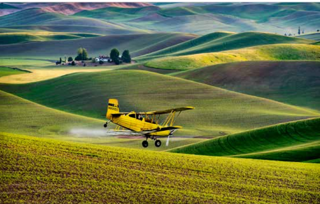
Palouse Field Spraying