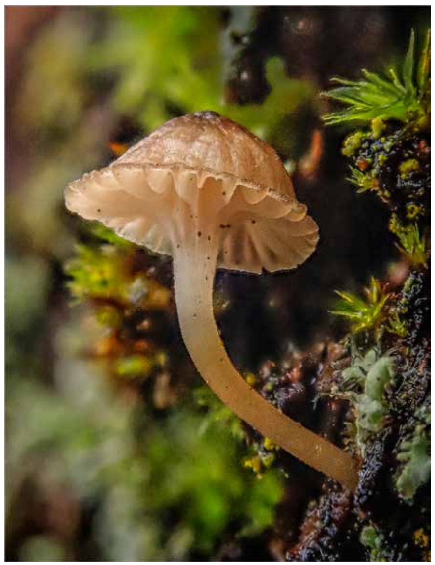
Very Tiny Mushroom